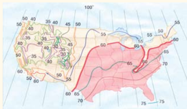
Fig. 2 Mean dew-point temperature isoclines for July and August (1946–1965) from the Climatic Atlas of United States .

Condensation can occur in either summer or winter, depending on climate and moisture conditions. A correlation exists between high outdoor dew-point temperatures (but not precipitation amounts) and incidences of mold. High mean dew-point temperatures (Fig. 2) are characteristic of most of the eastern United States, thus making these areas more susceptible to moisture-intrusion