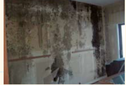
Fig. 1 Appearance of mold on drywall.

Mold is a natural part of the environment. Molds are forms of fungi found year round both indoors and outdoors. Mold growth is encouraged by warm and humid conditions, although it can grow during cold weather. There are thousands of specimens of mold and they can be any color. Most fungi, including molds, produce microscopic (2 to 10 µm) reproductive cells called spores. These spores typically disperse through the air continually and settle on all building surfaces, where they can remain dormant for years. Given the right circumstances, they may begin growing and digesting whatever they are growing on in order to survive. There is no feasible or cost-effective method to completely eliminate fungal spores from the indoor environment.